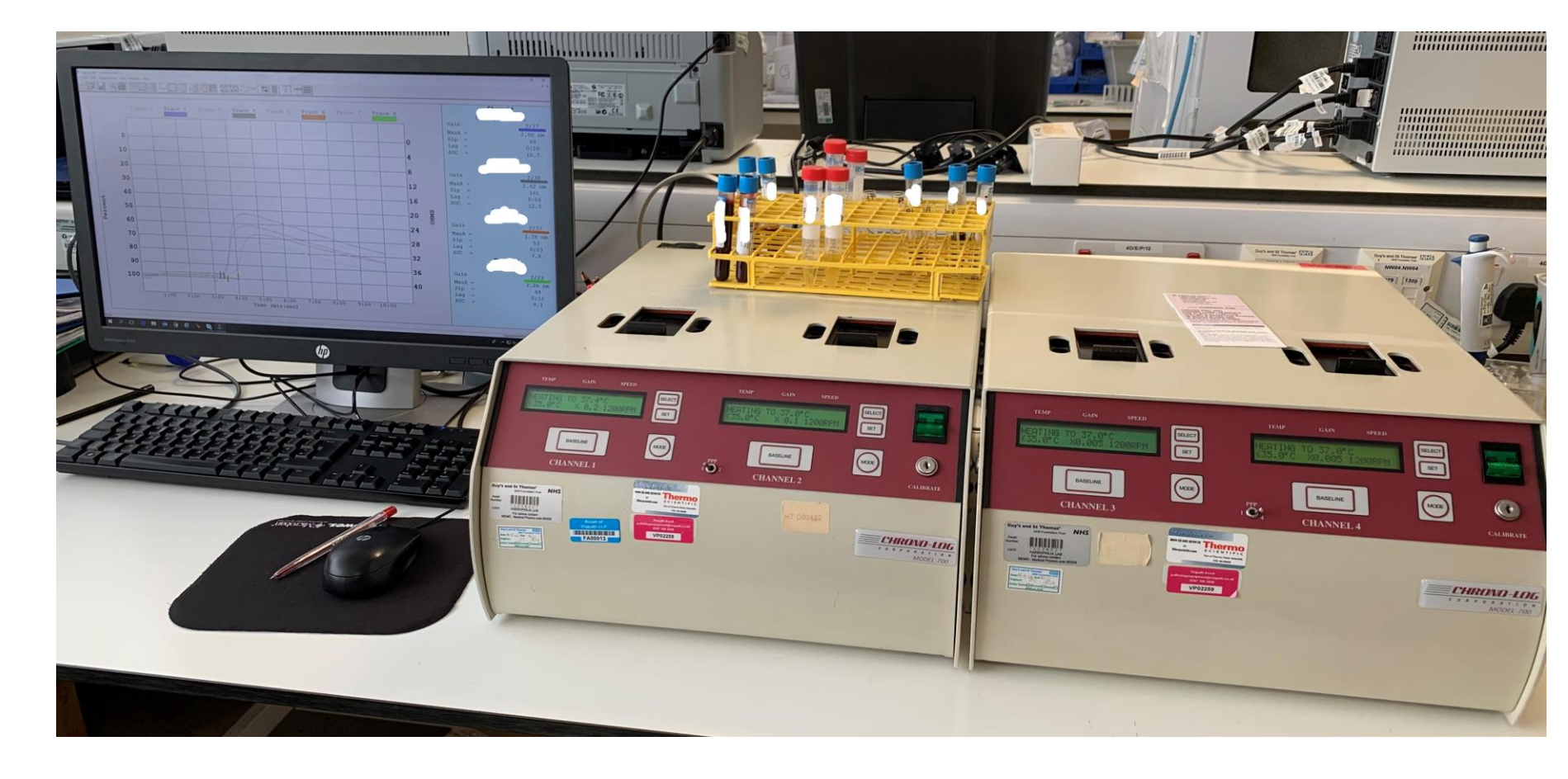
Fig 1: Chrono-Log Model 700 Whole Blood Lumi-aggregometer

The results were adjusted for platelet count to standardise and compare count. to an in house reference range.