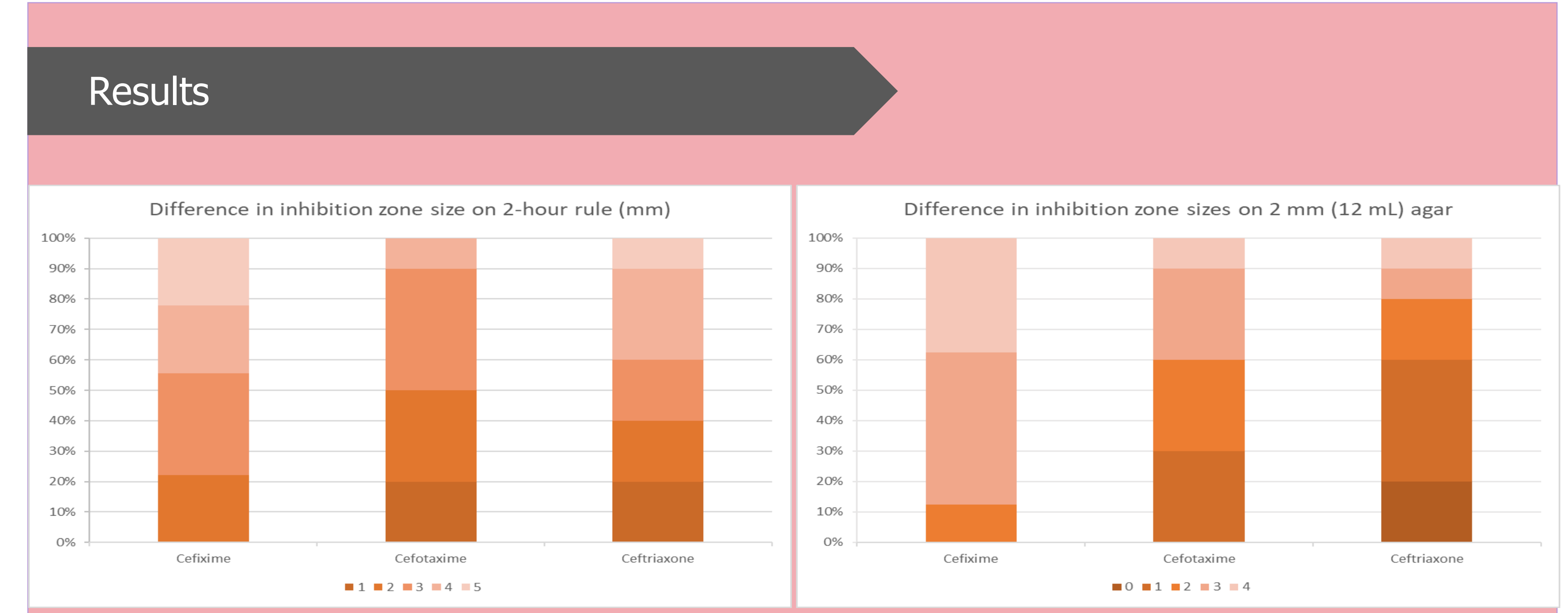
Figure 1: Difference in inhibition zone size when performing AST against three antibiotics (cefixime, cefotaxime, ceftriaxone) using a 2-hour rule. The different colour of boxes represent the difference of inhibition size when compared to the reference. The different size of the boxes represent the

Agar disk diffusion method for antibiotic susceptibility testing (AST) is currently used as the official method of AST in clinical laboratories due to its simple and wellstandardized procedure (Jorgensen and Ferraro, 2009). In 2019, the European Committee on Antimicrobial Susceptibility Testing (EUCAST) introduced a new term called the Area of Technical Uncertainty (ATU) in AST (EUCAST, 2019).