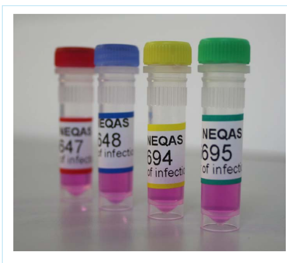
Figure 1: Specimens from a SARS-CoV-2 PoC distribution.

Each negative specimen was prepared using HEp-2 cells and viral transport medium.