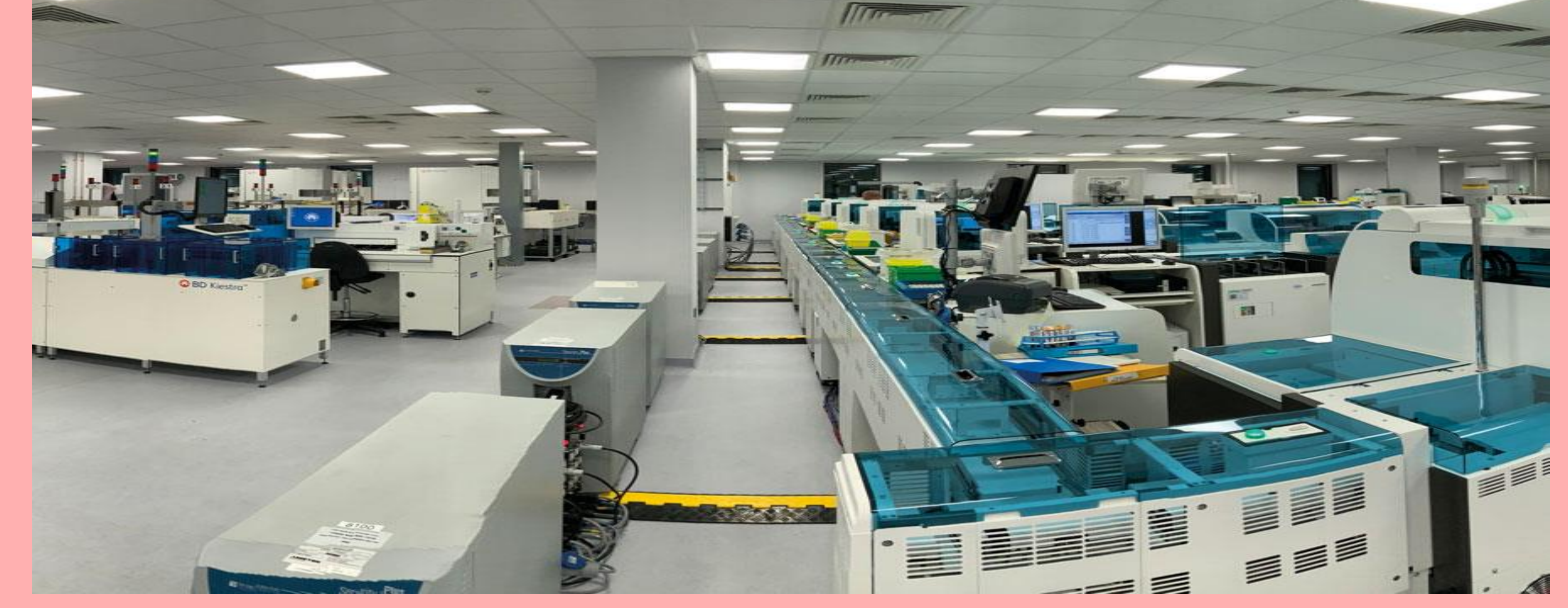
Fig 1: LCL Clinical Support Services Building

Establish working group with key stakeholders Rapid improvement event to further optimise process and automation Repeat audit in one year to check ongoing benefit and to assess impact of new processes e.g. Sepsityper. Customised report on Blood culture pathway KPIs