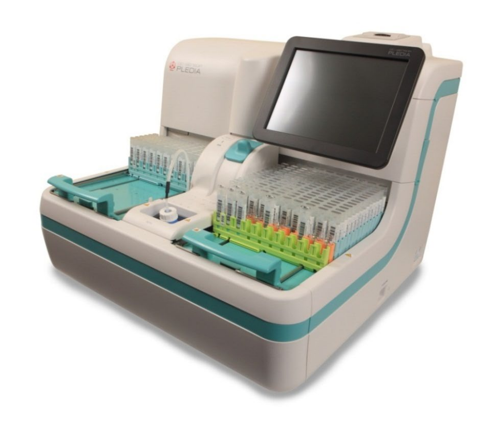
Figure 1 : OC-SENSOR PLEDIA (Eiken Chemical Co. Ltd., Japan) analyser